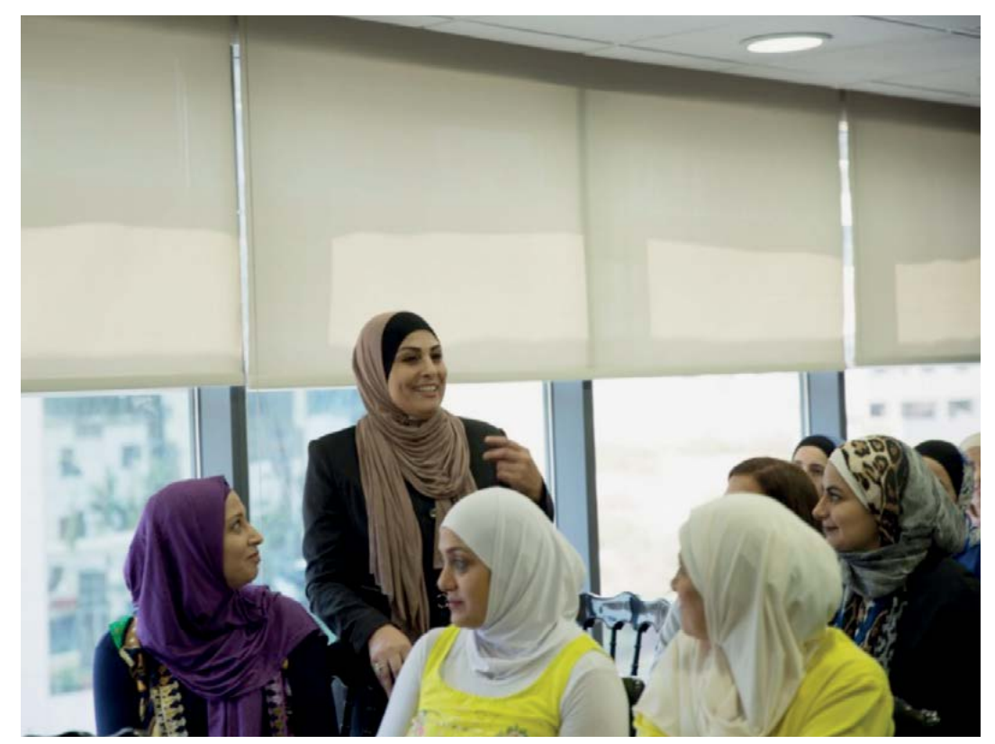
Microfund for Women Jordan

The SDC also supports and influences the private sector approaches of multilateral partner organisations (World Bank Group, UN funds/agencies, OECD) by incorporating its experience and best practices from its own partnerships with the private sector. Furthermore, the SDC participates in multilateral mechanisms for increased private sector involvement in the financing of measures in areas such as climate change and biodiversity . Ultimately, the aim is to co-determine the institutional strategies and implementation programmes of international organisations and achieve synergies with its own initiatives.